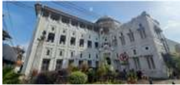
Figure 4 Jiwasraya insurance office