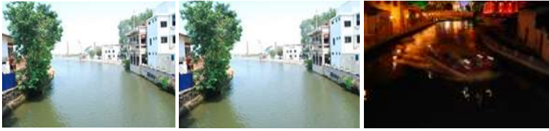
Figure 9 The river that was once dirty, is now one of the mainstay assets of tourism. River activities stay alive for tourists until 08.30 pm.

The struggle to achieve all of this requires a paradigm shift in the thinking of city stakeholders. In this case, it is necessary to understand the aspects of modernity related to economic, social, and cultural aspects.