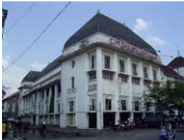
Figure 3 Djakarta Lloyd building

On the other hand, many buildings in the Semarang City, both within the Old City of Semarang area and outside the Old City, are the result of Karsten's designs. These buildings include: Djakarta Lloyd Building, PTP XIV Office, Jiwasraya Insurance Building, Sobokarti Folk Theater, PT KAI Office, House of Puri Gajahmungkur (Good Fellas Restaurant), Residential House on Wungkal Street, Puri Wedari, Elisabeth Hospital, Van Deventer High School, etc.