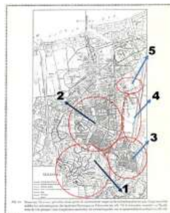
Figure 1 Semarang City expansion planning map by Karsten

Karsten made plans for the expansion of Semarang City to cover five areas. These areas are, the Candi Baru Area (1916), the areas of Pekunden, Peterongan, Batan, Wonodri (1919), the Sompok Area (1919), the East Semarang Area (1919), and the Mlaten Area (1924). If these five areas are put together, then this is the city of Semarang that now exists, outside the Old City. Thus, it can be concluded that Semarang City outside the Old City was the work of Karsten, and Karsten was the one who designed the New Semarang City at that time (figure 1).