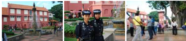
Figure 8 The Malacca Old Town area is a tourist destination for foreign tourists

Malacca has a cultural heritage in the form of a colonial city area and a Chinatown that is similar to the city of Semarang. Through a very long struggle (twenty years), finally this urban heritage area is well laid out, and has become the city branding of Malacca.