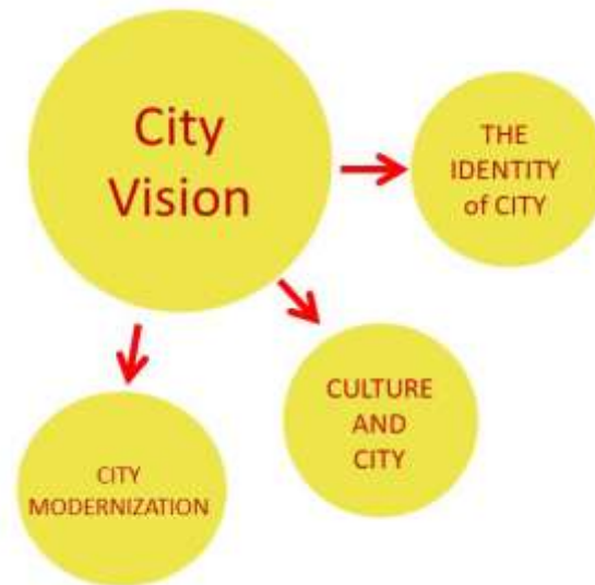
Figure 7 City vision

Thus, to get a holistic vision, it is necessary to know everything that is related to all the potential of the city, which is related to aspects: City identity/character, social, cultural, political, economic development of the city (figure 7).